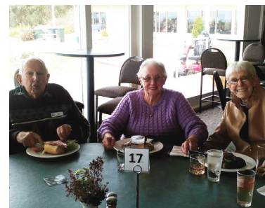
Group enjoying lunch at the Victor Harbor Golf Club