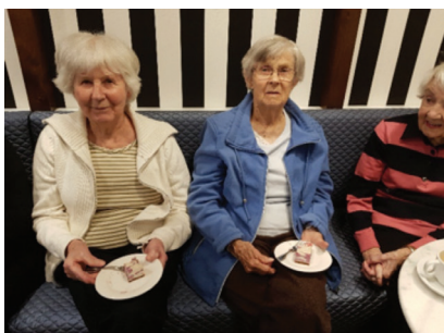
The coffee room