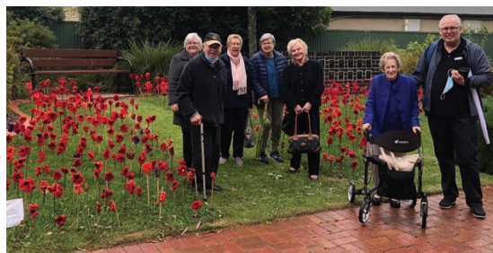
Remembrance Day Service at Hahndorf

Merry Christmas and a safe and happy new year