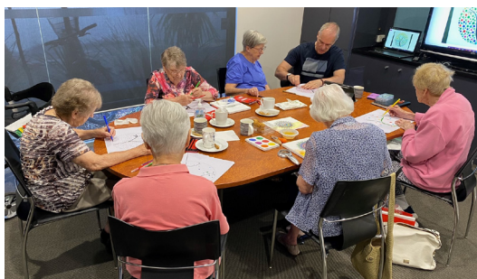
Art Therapy Group - Dotty Tree day

We often hear that clients are "saving" their funding against anticipated future needs. We have found that this strategy rarely turns out as hoped for clients and often the funding is never used. This means that the client goes without the full care and support available and does not achieve the best possible outcomes. We encourage you to make the most of the funding currently available to you. Please contact your coordinator to discuss how you can best utilise your budget now.