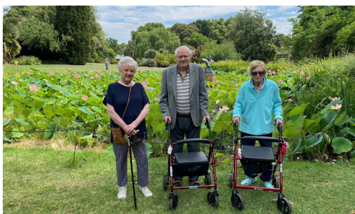
Lotus flower (walk n talk at the Botanic Gardens)