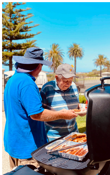
Men's Space at St Louis on Sea

Here at St Louis, we have the privilege using the amazing space at 'St Louis on Sea' for our Home Care Social Programs. Along the Esplanade at Victor Harbor we enjoy the views, the sound of the ocean and each other's company. Some of our social programs at 'St Louis on Sea' include the Men's space, Scone and Coffee Mornings, Art Therapy, BBQ Lunches and Pamper Days.