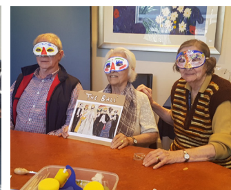
Art Therapy class

"Spring passes and one remembers one's innocence. Summer passes and one remembers one's exuberance. Autumn passes and one remembers one's reverence. Winter passes and one remembers one's perseverance". Yoko Ono