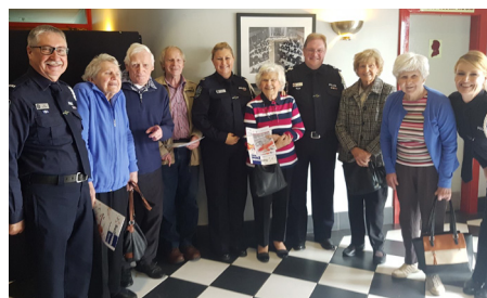
SA Police Band