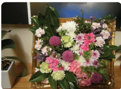
Flower arranging activity