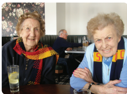
Lunch bustrip before grand final