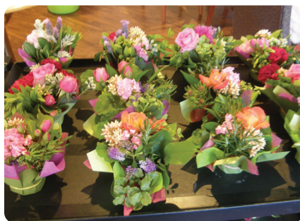
More flower arranging activity