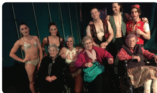
Trip to Ashtons Circus

Comments and complaints Feedback: If you have any feedback positive or negative, please don't hesitate to let us know. St Louis Aged Care, 21 Foster Street, Parkside SA 5063. Thank you