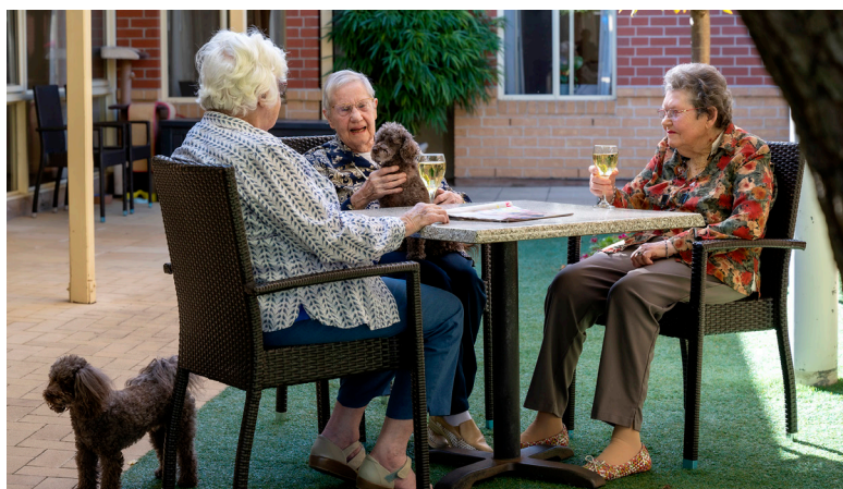
Our residents enjoying a drink and chat in the courtyard

As you are welcomed into our nursing home, one of our highly qualified Registered Nurses will sit down with you to listen to what is important to you. Together we will work with you to create a plan of support that you choose, and that helps meet your unique physical, mental and emotional needs. The support and care you will receive at St Louis are underpinned by our core values of Dignity, Respect, Fairness and Choice.