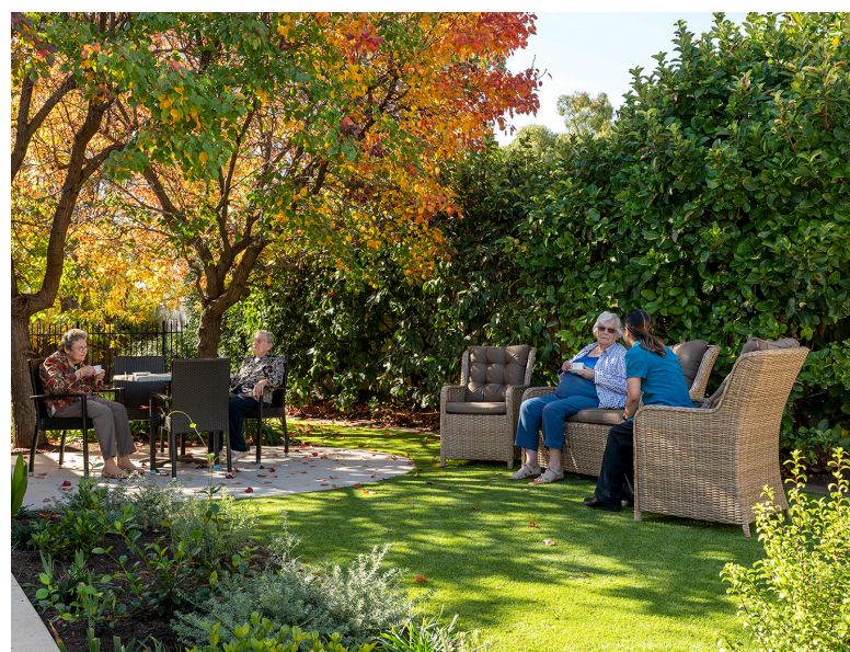
Enjoying time outside